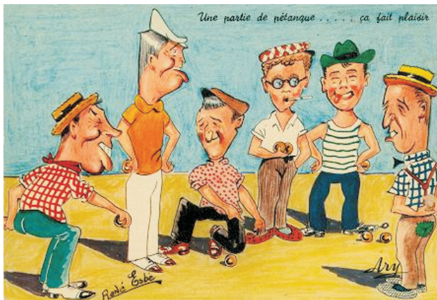
A game of Pétanque...it's a pleasure (...and don't we know it)

"Coonawarra – Australia's other Red center"